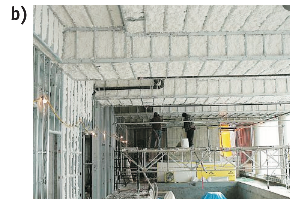
b) Installation underway.