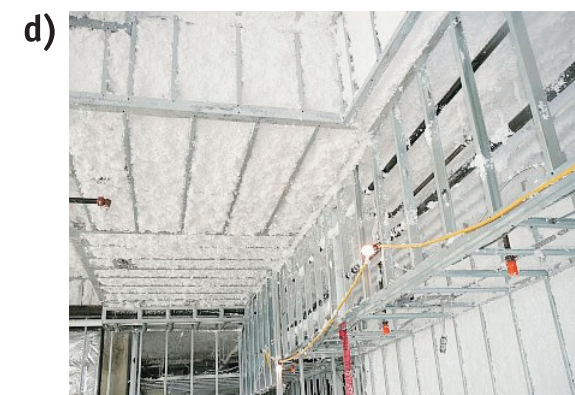
d) Complexity of the framing does not adversely affect the ability to achieve a monolithic installation as illustrated by pictures d) and e).